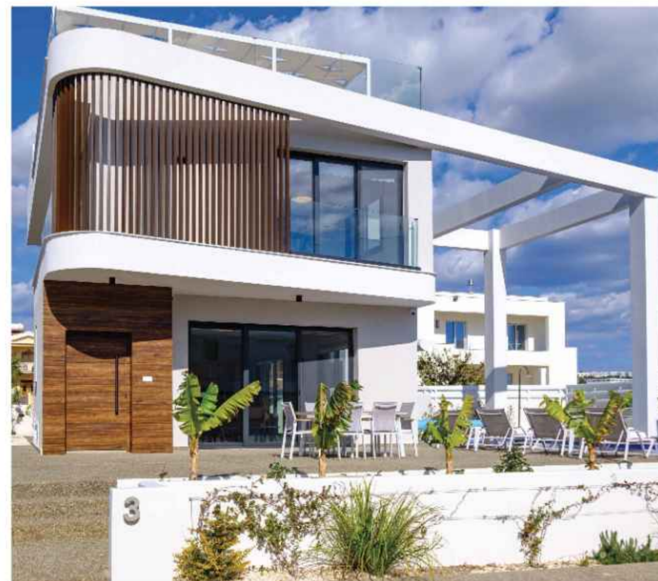
NISSI RESIDENCE CYPRUS