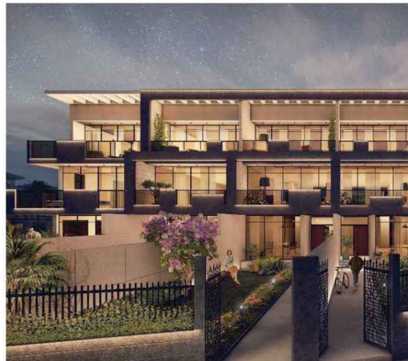
CASA LUXO JUMEIRAH VILLAGE CIRCLE, DUBAI