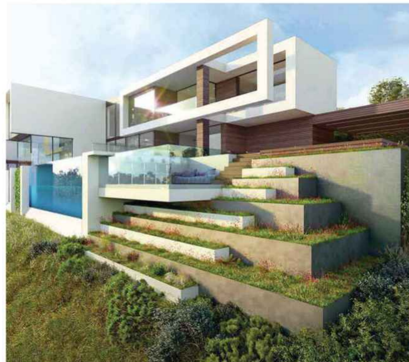
ALMYRA RESORT CYPRUS