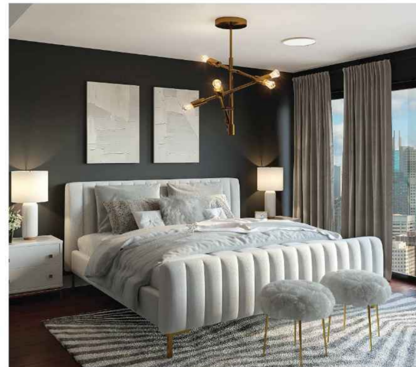
SHEPHERD BUSH LONDON UK