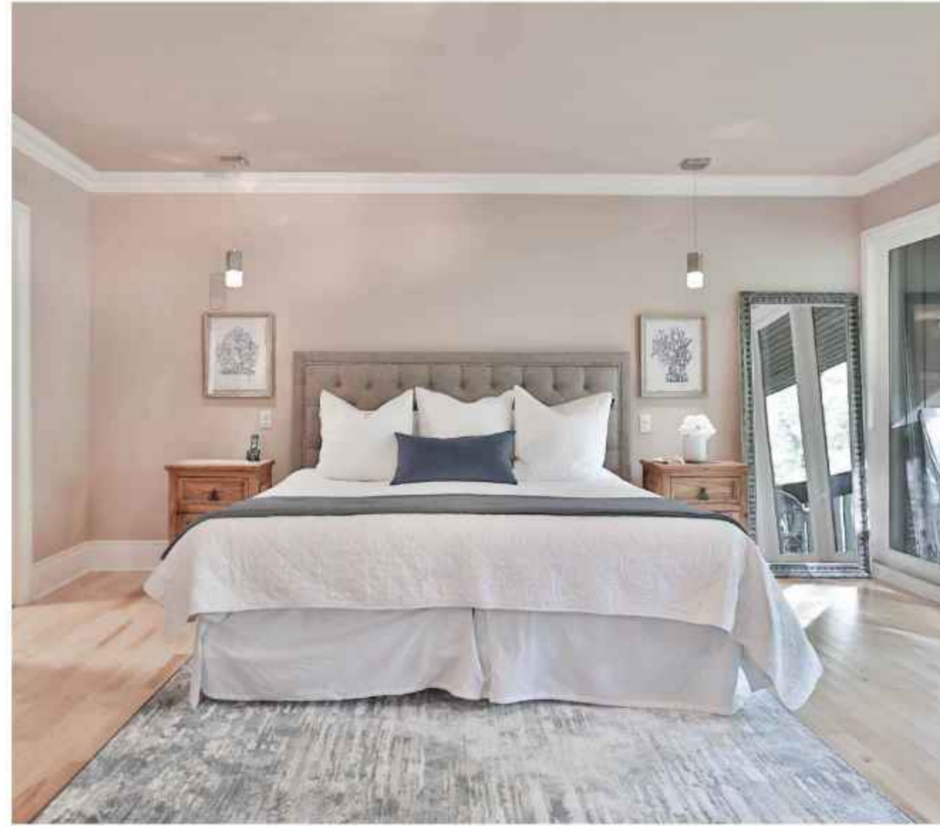
RADFORD GATE LONDON UK