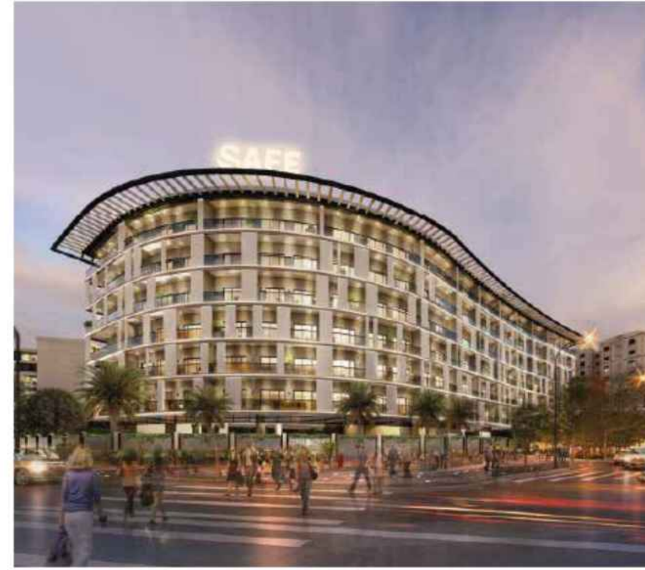
GARDENIA LIVINGS ARJAN, DUBAI