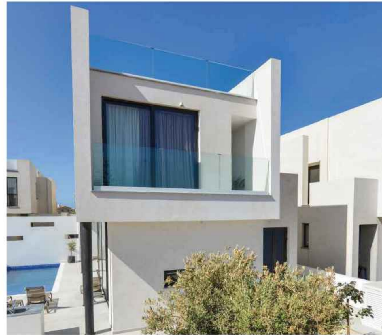
AL MARIA CYPRUS