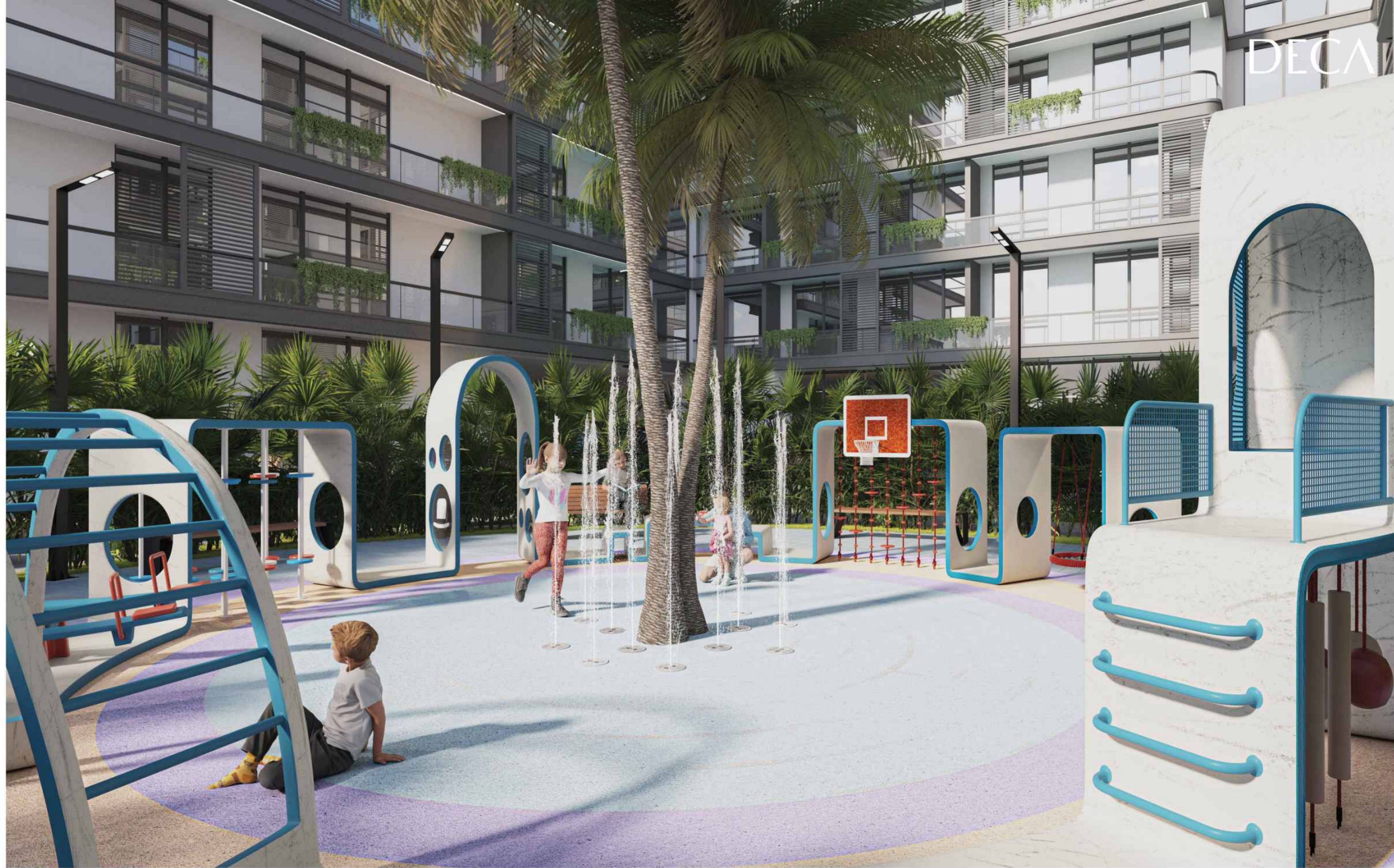
KIDS PLAY AREA WITH WATER FEATURES