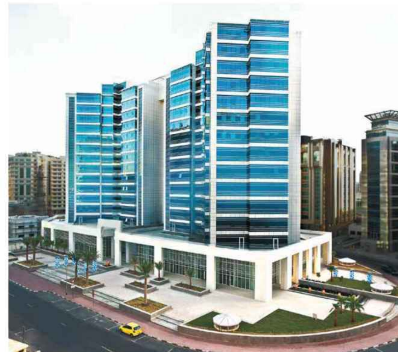
CENTURION STAR PORT SAEED, DEIRA