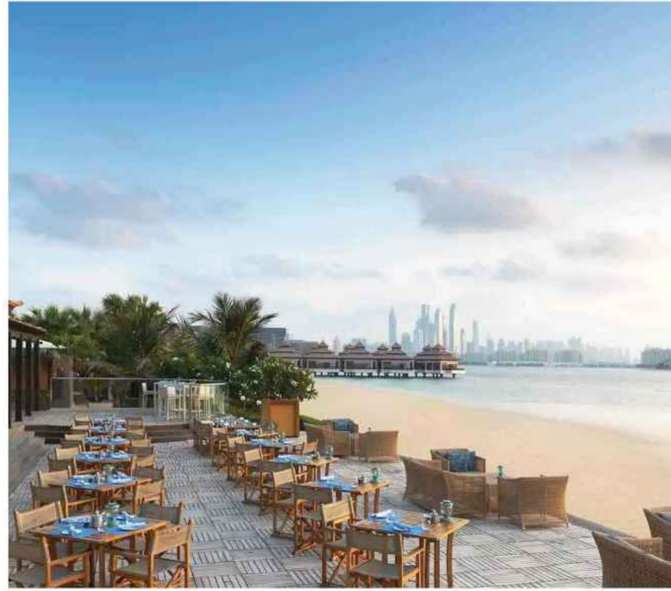
THE BEACH HOUSE PALM JUMEIRAH ,DUBAI