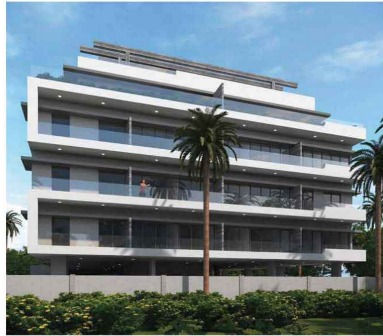
CENTURION ONYX MEYDAN AVENUE