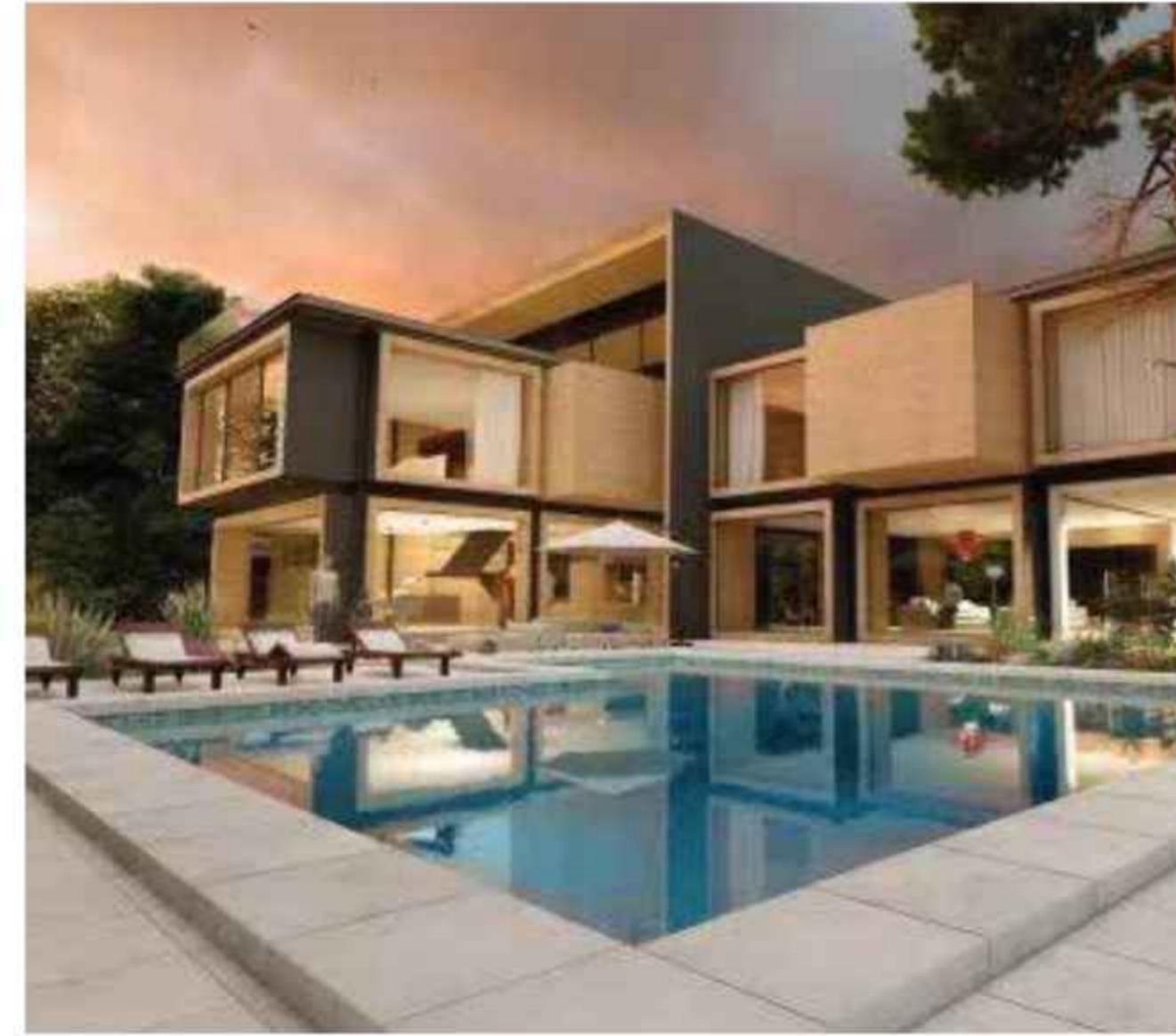
THE PLAIDES VILLAS CYPRUS