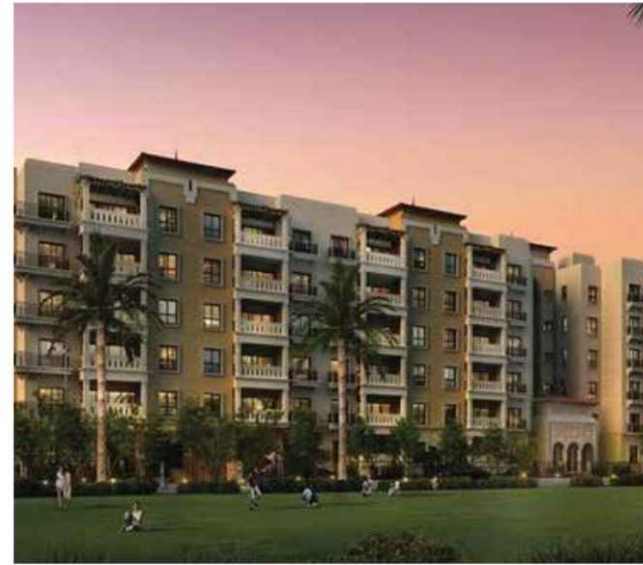
CENTURION RESIDENCE DUBAI INVESTMENT PARK -2