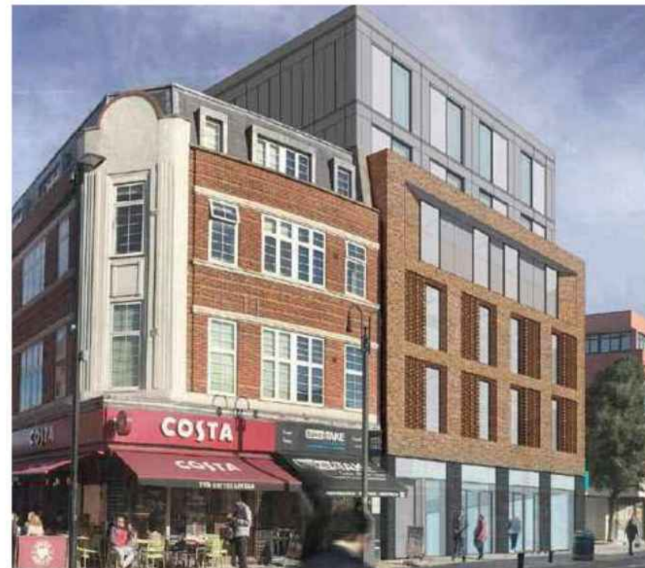
GRANDBELL PROPERTIES HOUNSLOW, UK